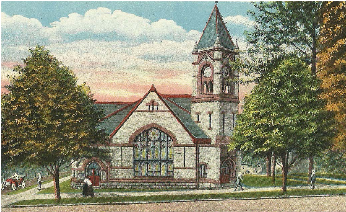
Early postcard of Prospect