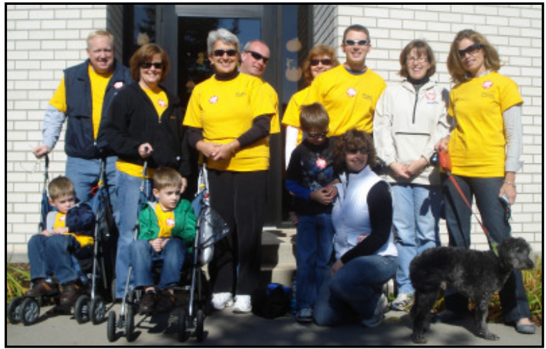
The Prospect Walk Team

Ten walkers from Prospect participated in the Southington Crop Walk on October 25, raising more than $650 toward the fight against hunger with walker donations and money placed in the soup pot in Sessions Hall.