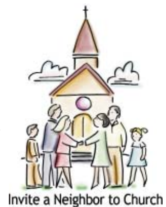
Invite a Neighbor to Church

The "Genesis" of the meeting is very easy to understand. Our congregation is aging and we have lost some very special and very important people this past year. We have some very good signs of life: our Sunday School is growing, our Steven's Ministry has just graduated its first class of students and we have some very good volunteers doing important work around our church. But, looking at where our congregation will be 10 years from now, will our participation slowly evaporate away? The trend for mainline congregations is alarming — will Prospect United Methodist Church be a part of the alarming mainline statistics?